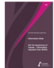
IAASA's Information Note (March 2021)

Refer IAASA's Information Note for more information.