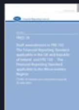
FRC Exposure Draft (April 2021)

Refer the FRC Exposure draft for more detail.