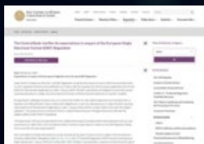
Expectations in respect of the European Single Electronic Format (ESEF) Regulation

Refer the CBI announcement for further details.