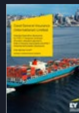
Good General Insurance (International) Limited