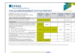
EFRAG Endorsement Status Report (2 April 2021)

The report further contains a list of all IFRS, amendments to IFRS and IFRS Interpretations endorsed in the EU, providing for each of them the date when it became effective in the EU, the date the endorsement decision was made and the date when it was published in the Official Journal of the European Union.