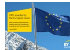
IFRS adopted by the European Union 31 December 2020

Our publication provides an overview of the status of the EU endorsement process for IFRS at 31 December 2020 with an EU effective date after 1 January 2020. Some standards and amendments are adopted by the EU with an effective date later than that established by the IASB. We have separately listed the effective date of application in the EU in this publication.