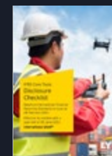
IGAAP® Disclosure Checklist - financial statements with a 30 June 2021 year end