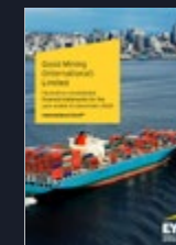
Good Mining (International) Limited - Illustrative consolidated financial statements (December 2020)