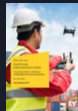
Good Group - Interim consolidated financial statements (March 2021)

Other EY IFRS technical resources including practical technical guidance, latest thinking and tools from EY financial reporting professionals are available here .