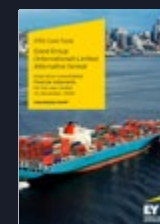
Good group (International) limited alternative format - (December 2020)