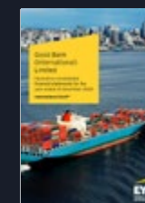
Good Bank (International) Limited (December 2020)