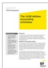
IFRS Developments issue 186 - IASB defines accounting estimates

The Board’s amendments to IAS 8 - Accounting policies, changes in accounting estimates and errors are designed to clarify the distinction between changes in accounting estimates and changes in accounting policies and the correction of errors. Our IFRS Developments Issue 186 discusses the amendment to IAS 8 in detail.