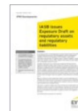
IASB issues Exposure Draft on regulatory assets and regulatory liabilities

The IASB issued an Exposure Draft that sets out proposals for the recognition, measurement, presentation and disclosure of regulatory assets, regulatory liabilities, regulatory income and regulatory expense. When adopted, these proposals would replace IFRS 14 Regulatory Deferral Accounts. Our IFRS Developments Issue 184 provide more information on the IASB's Exposure Draft.