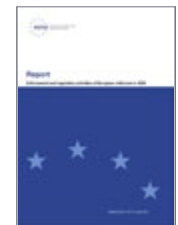
ESMA Report on the Enforcement and regulatory activities of European enforcers in 2020

Refer the ESMA report for more information.