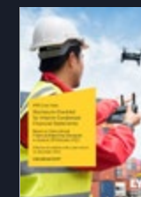
International GAAP® Disclosure Checklist - IFRS in issue 28 February 2021