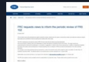
FRC Announcement (23 March 2021)

Refer the FRC announcement for further details.