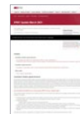
IFRIC Update (March 2021)