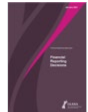
IAASA's Financial Reporting Decisions (January 2021)

Refer IAASA's Financial Reporting Decisions for more information.