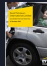
Good Petroleum (International) Limited (December 2020)