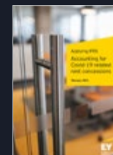
Applying IFRS: Accounting for COVID-19 related rent concessions (February 2021)