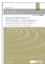
Disclosure Requirements in IFRS Standards - A Pilot Approach

In March 2021, the IASB published the Exposure Draft - Disclosure Requirements in IFRS Standards–A Pilot Approach. The Exposure Draft sets out a proposed new approach to developing and drafting disclosure requirements in IFRS Standards as well as new disclosure requirements for IFRS 13 Fair Value Measurement and IAS 19 Employee Benefits. The Board is seeking feedback by 21 October 2021 on whether those proposals would help companies and other stakeholders improve the usefulness of information disclosed in financial statements. Refer the IASB’s Exposure Draft for more information.