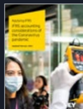
Impairment considerations for lessees that plan to reduce their real estate

Entities that closed their offices or use them at a reduced capacity due to COVID-19, may consider reducing the use of real estate going forward. Our publication addresses some common issues lessees may encounter if they plan to reduce the amount of space they use. Lessees should understand the interaction between the guidance in IAS 36 Impairment of Assets and IFRS 16 Leases. For owners of real estate, an expected change in use will often give rise to similar considerations; the guidance in this article may be applied by analogy.