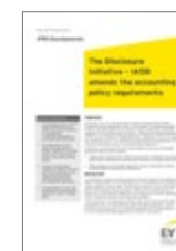
The Disclosure Initiative - IASB amends accounting policy requirements

The IASB's amendments provide guidance and examples to help entities apply materiality judgements to accounting policy disclosures. Our IFRS Developments Issue 187 publication summarises the amendments.