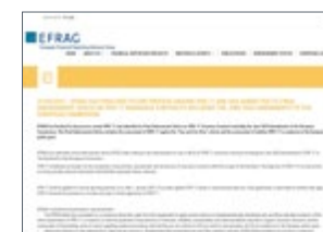
EFRAG Final Endorsement Announcement

Refer to the EFRAG announcement for more information.