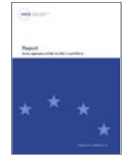
ESMA Report on the application of IFRS 10, IFRS 11 and IFRS 12

Refer the ESMA report for more information.