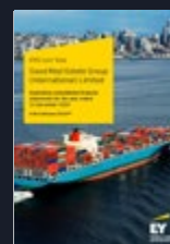
Good Real Estate Group (International) Limited (December 2020)