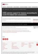
IASB's amendment to IFRS 16 (March 2021)

Refer the IASB's amendment to IFRS 16 document for more detail.