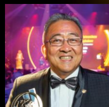
2018 Song Hoi-see Plaza Premium Lounge Management Ltd.