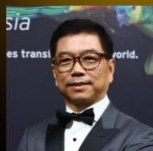
2019 Dang Tai Luk myNEWS Holdings Bhd.