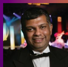
2006 YBhg. Tan Sri Tony Fernandes AirAsia Bhd.