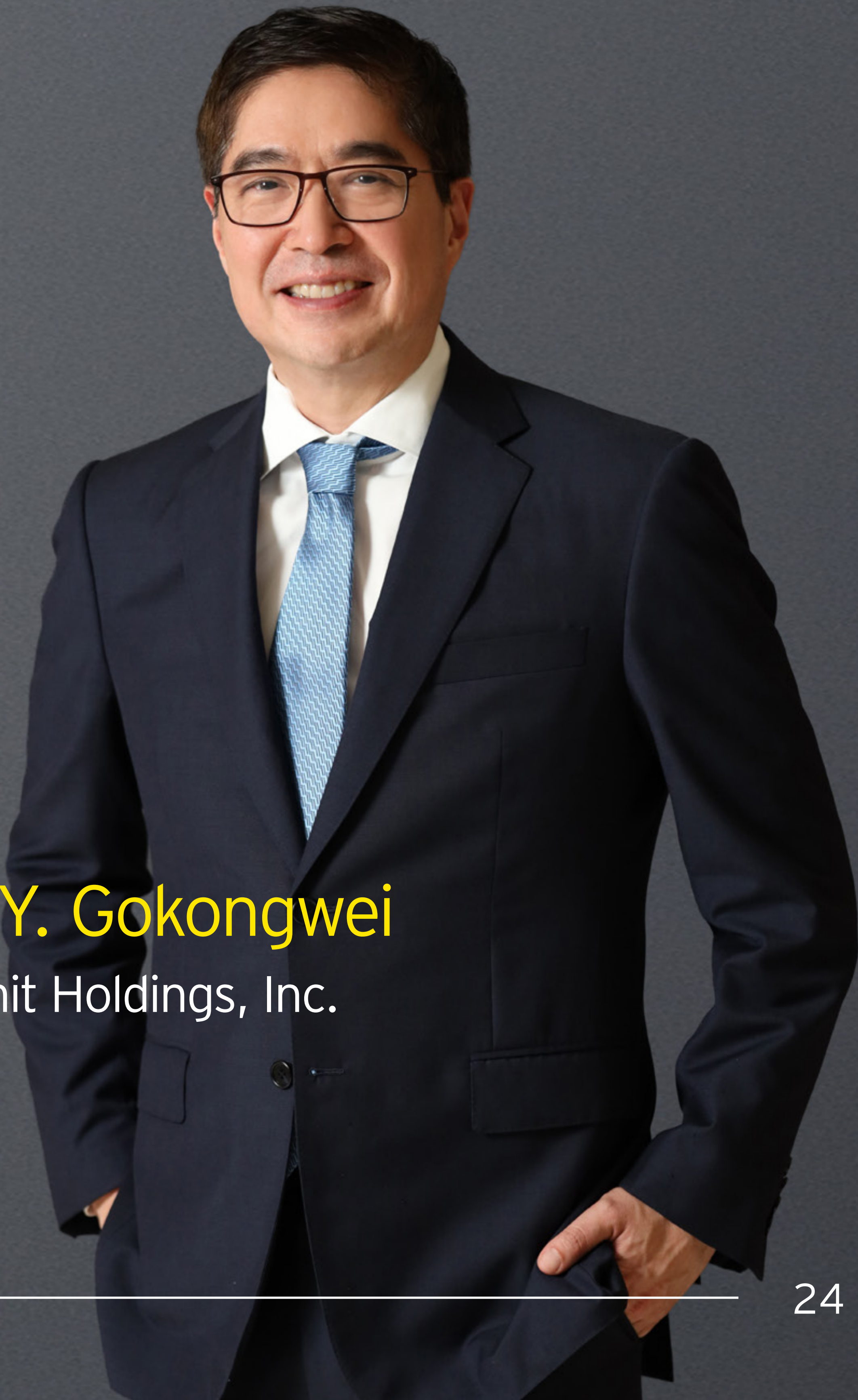
Lance Y. Gokongwei JG Summit Holdings, Inc.

Launched in 2015, the EY Asean Entrepreneurial Excellence award honors Asean leaders who make a difference, inspire and motivate the business community to achieve excellence in their respective industries.